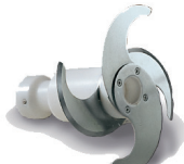
Pesto sauce knives