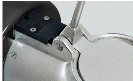
Microswitch on the lever