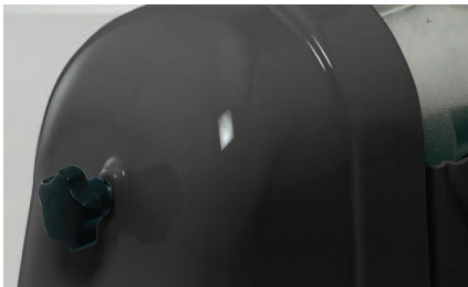
Cut thickness adjusting knob