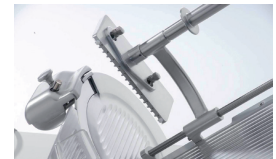
End weight lifted up for easy product loading