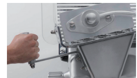
Ergonomic carriage handle