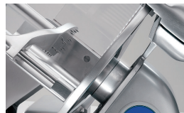
Wide gap between blade and body

Operation..... Gravity feed. Construction ..... Polished, anodized aluminum alloy. Knife ..... 13" (330 mm), one piece, GB blade, long lasting sharp edge Sharpener..... Built-in, removable, two store dual action. Slice thickness..... Infinitely variable up to 13/16". Motor ..... 1/2 Hp (410 W), belt driven, fan cooled. Electrical ..... 120V AC, 60Hz, 3.4A (220V, 50Hz available on request). Plug and Cord..... Attached, flexible, 3 wire SJT 18 AWG, 6'4" long cord. Switch ..... Electrical keypad with on/off buttons. (TOP version). Height ..... 24 3/16 " Width ..... 27 15/16 " Depth ..... 26 3/16 " Net Weight..... 81 lb Shipping Weight ..... 116 lb