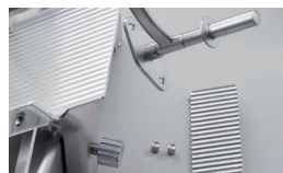
Removable end weight pusher

WARRANTY 1 (one) year parts and labor valid in the Continental United States.