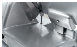
Large receiving tray