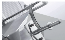
End weight placed underneath carriage for easy cleaning and product loading