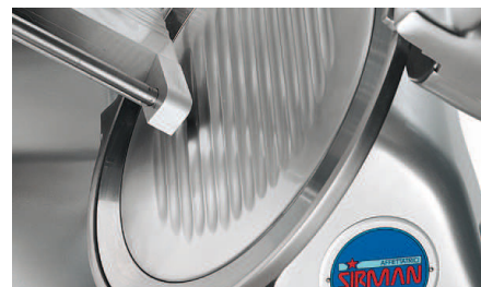
Inner blade cover avoids product waste

Office: 11900 Biscayne Blvd. Suite 512 North Miami, FL 33181 - USA Phone: 305-868-1603 Fax: 305-866-2704